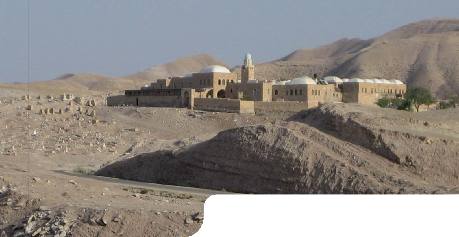
Nabi Moussa Monastery

Agence Française de Développement is a public establishment with a mission of general interest: to finance development. As a specialized financial institution, AFD supports projects with economic or social impacts in both public and private sectors: infrastructure and financial systems, urban and rural development, education and health.