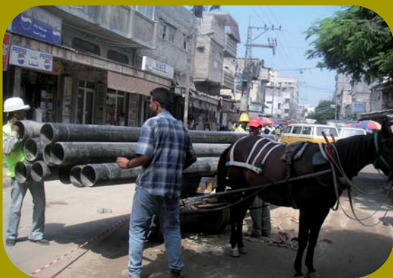
Renovating Gaza's water networks