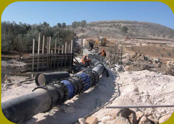
Water supply in Hebron

These projects mainly use local enterprises to carry out works and therefore create employment and distribute income. This is essential in view of the current humanitarian crisis and the collapse of the Palestinian economy. They also support efforts made by the Palestinian Government in terms of investment planning and rationalization. An expertise fund was set up alongside the Paris Conference and finances periodic support to capacity building for local authorities.