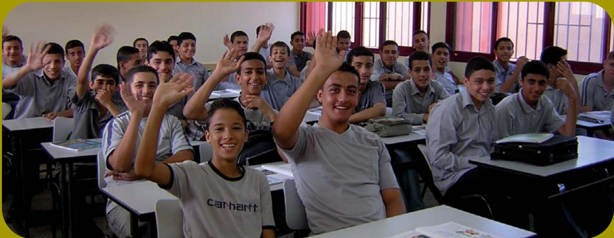
A school in Gaza