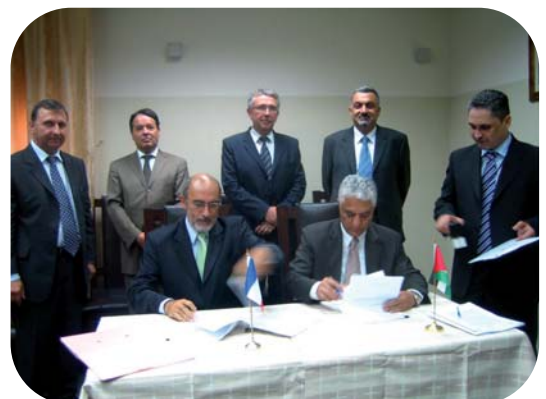
Signing of financing agreements with the Minister of Planning

A focus for project implementation is to involve civil society and city-to-city cooperation stakeholders which are very active in Palestine. Partnerships have been established with both Palestinian NGOs, such as Welfare Association, and international NGOs (MDM France, Green Cross France, ACAD...). Partnerships have also been built with French local authorities, in particular Greater Lyon Urban Community, the City of Dunkerque and the Adour-Garonne water agency.