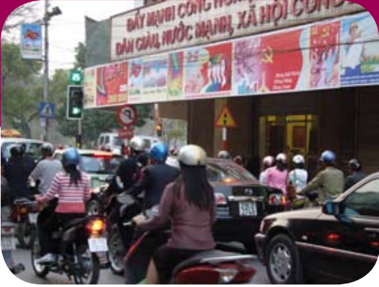
Urban growth requires basic service provision and environmental impact management.