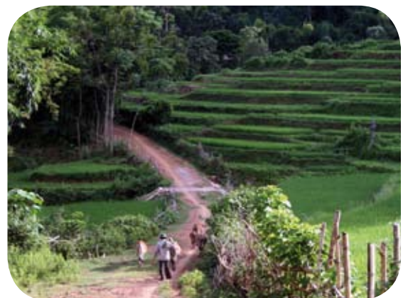
The aim of rural basic infrastructure financing is to reduce poverty, particularly for ethnic minorities.