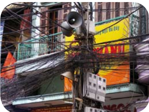
Access to energy for all is one aspect of energy efficiency.

The international forum on energy efficiency held in Ho Chi Minh City in April 2008 gathered international and Vietnamese experts and public authorities and, through concrete examples, focused on issues concerning housing, urban programming and mobility, municipal service management, investment in energy saving, the use of renewable energies etc.