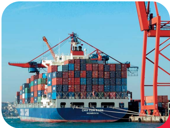
Containers in Istanbul Port

On 5 February 2009 Turkey signed the Kyoto Protocol which aims to combat climate change by reducing CO 2 emissions. AFD is supporting this process by financing the development of renewable and clean energies and the creation of infrastructures (transport, water and sanitation, household waste) in order to reduce the country's carbon footprint. This support is conducted via projects led by Turkish partner banks (TSKB, Garanti, Akbank) which can additionally benefit from specialized technical assistance when required.