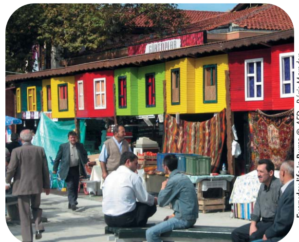
Everyday life in Bursa