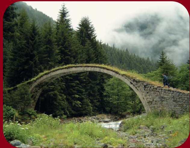
A bridge in the Black Sea region