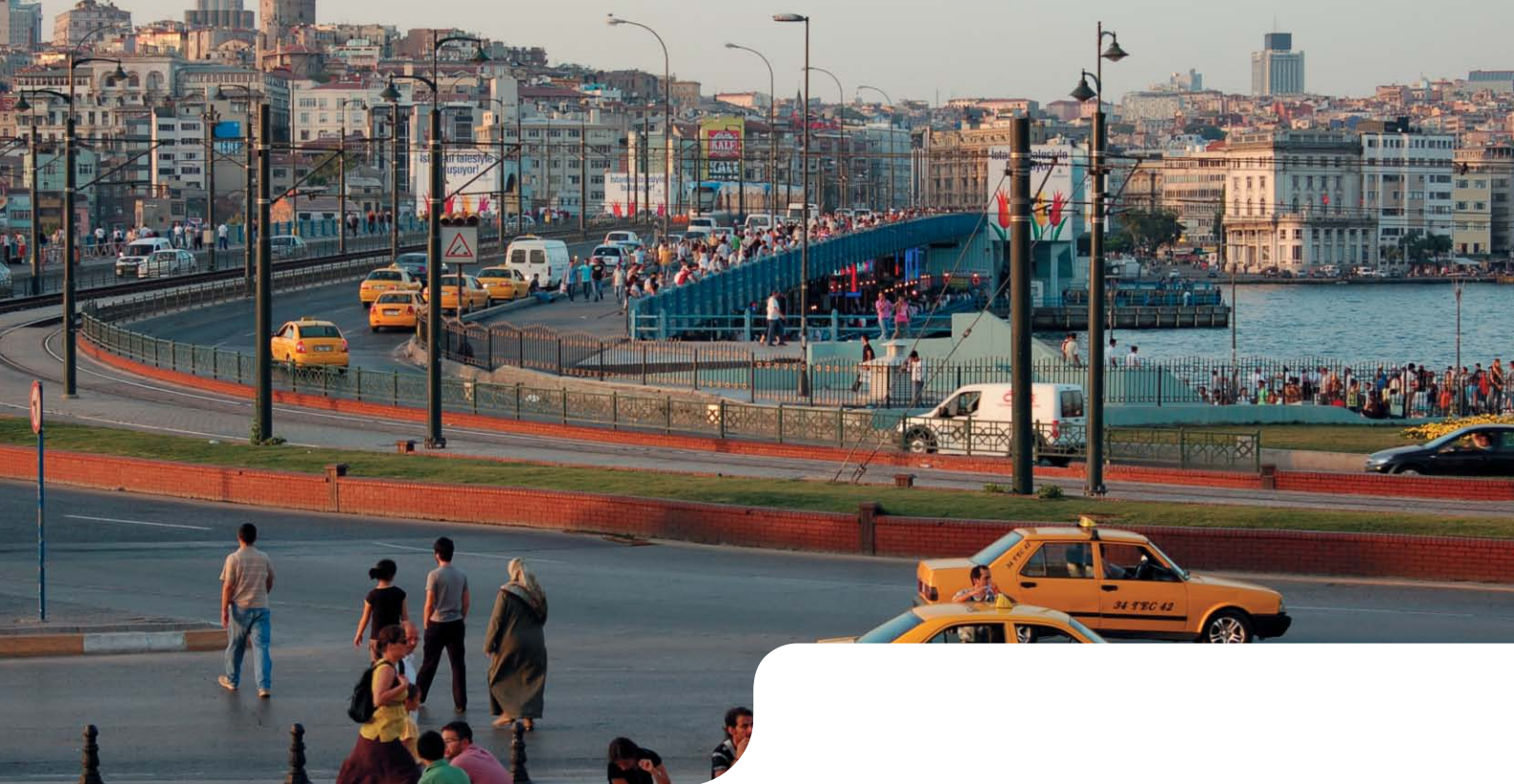
Galata bridge

Agence Française de Développement (AFD) is a public establishment with a mission defined by the French Government. It has been combating poverty and promoting development in South countries for over 60 years.