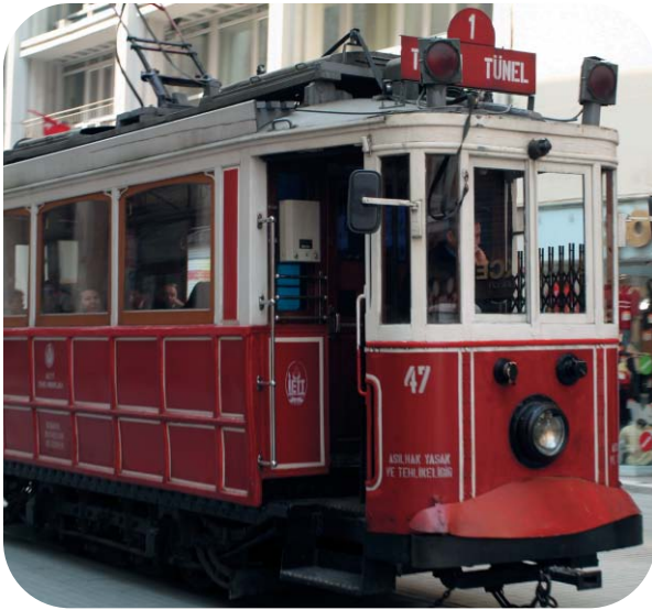
Historic tramcar