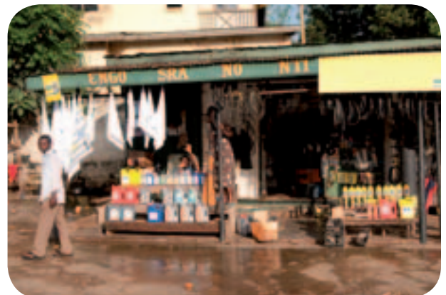
Retail shop © Thomas de Gubernatis