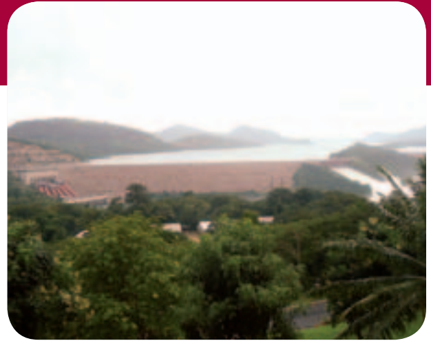
Akosombo dam