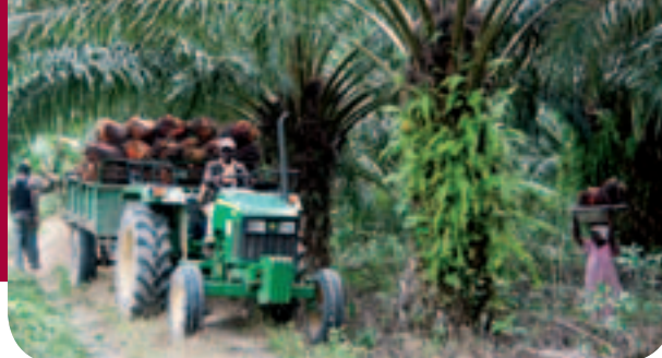
Fresh fruit bunches harvest

of financing since the agency opened in Ghana