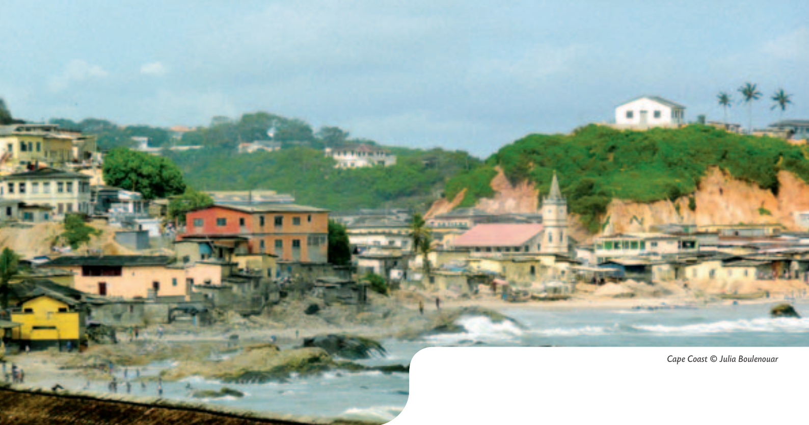
Cape Coast

AFD, the Agence Française de Développement , is a public development finance institution that has worked to fight poverty and support economic growth in developing countries and the French Overseas Provinces for 70 years. AFD executes the French government's development aid policies.