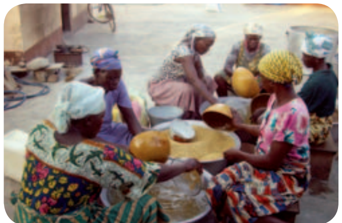
Paddy rice cleaning before parboiling

The sector-based approach has had a significant impact on the development of agricultural production and on the increase in monetary income for the relevant rural communities. The models for the tripartite agreement have, in this respect, been an innovation that AFD wishes to develop for other crops (notably cocoa) with new technical and financial partners. AFD has consequently become a key development partner for the sector and its know-how as well as the direct impact of projects are recognised by the Ghanaian authorities.