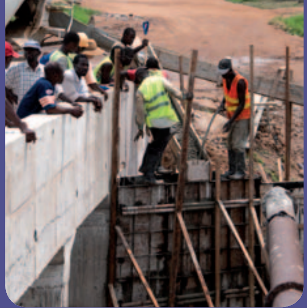
Drain construction

Since the early 1990s, AFD has indeed been pursuing a programme to promote perennial crops in partnership with the Ministry of Food and Agriculture ( Programme for the Promotion of Perennial Crops – PPPC ), for which the currently ongoing phase amounts to €19.4m. A new phase for this project is being prepared for 2012. Since August 2010, AFD has also been implementing the first non-sovereign financing in this sector with