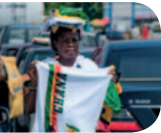
Street seller

AFD helps financial institutions to introduce " mesofinance " via technical assistance and consequently gives access to credit to an intermediate category of SMEs, which are neither considered as micro-enterprises, nor as corporate. This type of financing is often the missing link between the range of financing options offered by microfinance institutions (MFIs) and those offered by commercial banks.