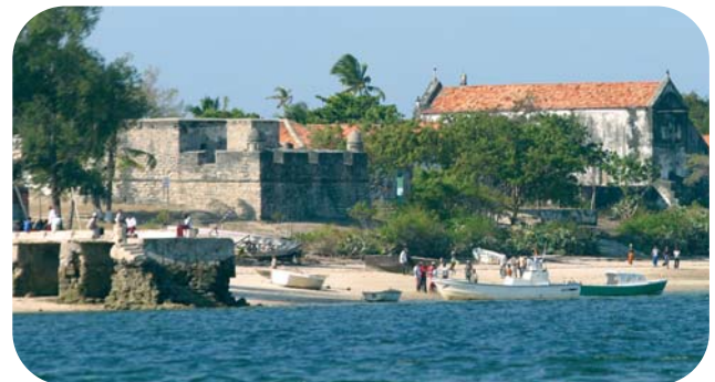
View of Ibo Island