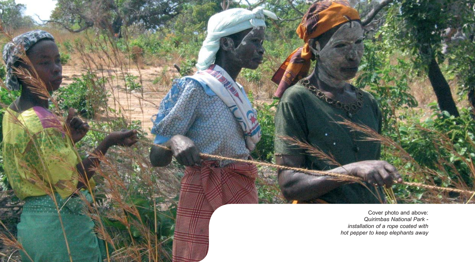
Cover photo and above: Quirimbas National Park - installation of a rope coated with hot pepper to keep elephants away

Agence Française de Développement is a public establishment with a mission of general interest: to finance development. As a specialized financial institution, AFD supports projects with economic or social impacts in both public and private sectors: infrastructure and financial systems, urban and rural development, education and health.