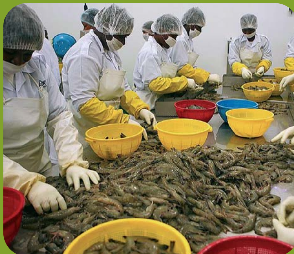
Quélimane - Aquapesca – shrimp farm