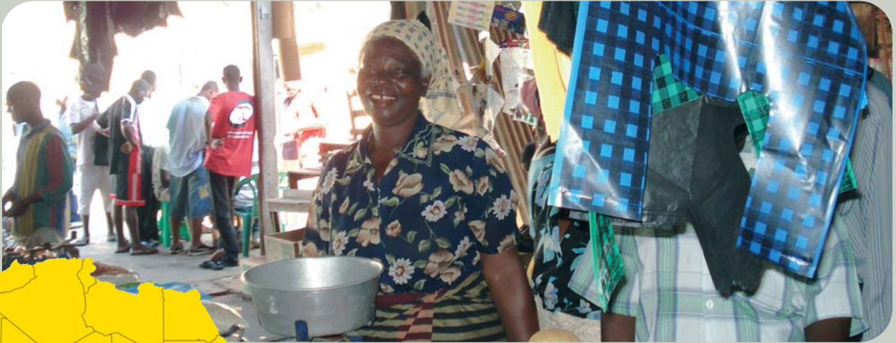
Maputo market – microcredit beneficiary