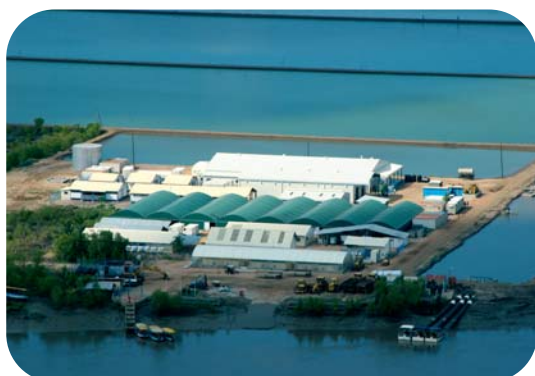
Quélimane - Aquapesca – shrimp farm

AFD's operations in Mozambique also have a regional dimension via fundings that contribute to economic effectiveness and regional integration, such as transfrontier parks or energy sector infrastructures.