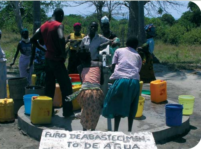
Quirimbas National Park – community activities (a well)

After over 15 years of civil war which came to an end in 1992, Mozambique, with the support of the international community, engaged upon a far-reaching reconstruction and reform programme. Its efforts have led to strong growth with an annual average of around 8% for the last ten years. The government's development strategy is defined in the PARPA (Action Plan for the Reduction of Absolute Poverty). Following the positive outcomes of PARPA 1 (2001-2005) which brought down the percentage of the population living below the poverty line from 69% in 1997 to 54% in 2003, PARPA 2 (2006-2009) aims to reduce poverty to 45% by 2009 and maintain a strong growth (7% per annum) in particular thanks to private sector development. PARPA 2 is based on three main pillars for reform: governance, human development and economic development.