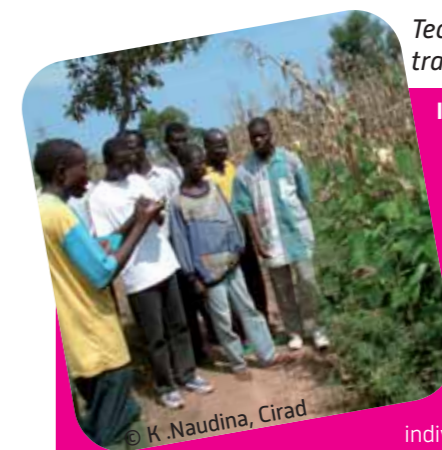
Technicians and farmers being trained in CA.

In Northern Cameroon , Project ESA (Eau/Sol/Arbre, or Water/Soil/Trees in English) tries to find organizational solutions to the frequent problem of biomass conservation in the Sudano-Sahel region caused by long dry periods and common grazing. Due to very complex landed property laws and crop residue management system, the enclosure of individual fields can only be a partial solution. To facilitate the dissemination of CA techniques, the project therefore opted for a "community land management" approach based on the establishment of a village consultative framework for ensuring both quantitative dissemination targets, the involvement of all stakeholders of the community, the delimitation of zones for specific activities and the development of collective rules for access to crop residues and their conservation. Further, special support is given to stock breeders in order to promote the development of fodder production in the zones set aside for the purpose and, in this manner, reduce pressure on crop residues. The biomass conservation rate in community lands is 71% compare to only 21% in fields outside the community lands.