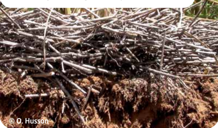
Rice on a Stylosanthes guianensis plant cover.

In Madagascar , cropping systems based on the use of Stylosanthes guianensis have been developed in all of the agricultural zone below 1200 m of altitude, irrespective of soil type. Stylosanthes happens to combine high nitrogen fixation, soil decomposition and weed control (especially Striga asiatica ) capabilities with the capacity to also serve as source of fodder for cattle. It permits, in particular, to rapidly improve soil fertility. Stylosanthes -based cropping systems can be quite flexible and can be applied both to smallholder family manual farming operations involving little or no external inputs and to highly mechanized intensive agricultural operations. They can be initiated on very poor soils in association with cassava or directly with staple grains (e.g., rice, maize, etc.) on richer soils or with an initial application of fertilizers. The simplest systems to implement allow for the production of grains every other year. A higher frequency of grain production is possible with tighter management and the involvement of more inputs.