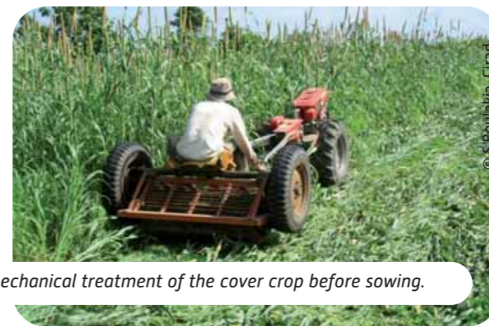
Mechanical treatment of the cover crop before sowing.

In the Kampong Cham Province, Cambodia , the agricultural support programme (or, PADAC) is based on the development of contractual relations between a farmers' organization (CFFO) and an agro-industrial entity specializing in the fodder conditioning (PROCONCO) for promotion of agro-ecological systems based on cassava, maize or soya beans. PROCONCO, which is desirous to strengthen its supply base, both qualitatively and quantitatively, would be willing to advance the funding (up to US$260 per hectare) for the campaign (the Project has guaranteed 30% of the amount of the credit) and to purchase the output at fixed rates (despite the volatility of the price of cassava), with a premium for quality. In addition to being able to access technical support from the Project, participating farmers are thus able to adopt the proposed innovations under rather favourable conditions. The target for the first year was set at 200 hectares for 200 farmers, with a production of 2000 tonnes of cassava and 250 tonnes of maize. The target for the three-year duration of the Project was a total of 8000 tonnes, comprising 80% of cassava and 20% of maize.