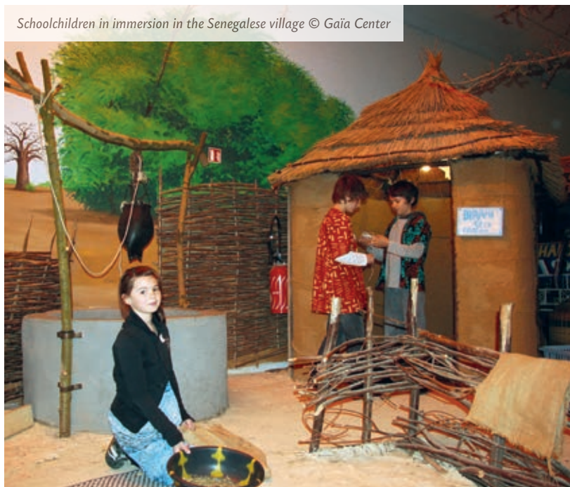
Schoolchildren in immersion in the Senegalese village