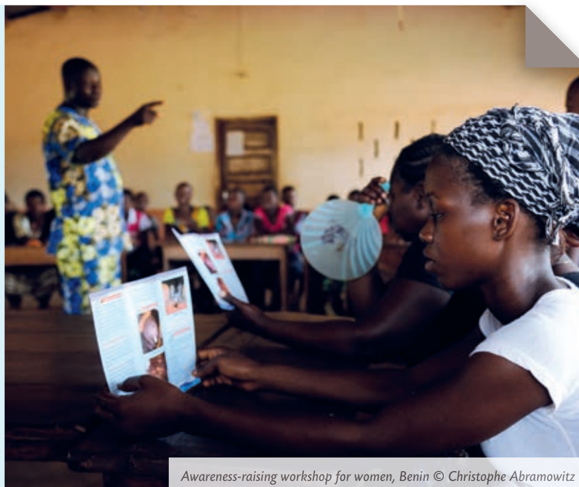
Awareness-raising workshop for women, Benin

The project, cofinanced with the Gates Foundation, is designed to improve the rights and sexual and reproductive health of women and adolescent girls, with a focus on access to contraception, in five African countries (Benin, Burkina Faso, Mali, Niger and Senegal). It involves assisting a network of local CSOs called "Alliance Droits et Santé" in the definition of national advocacy strategies, especially by strengthening their organizational capacities and via personal coaching.