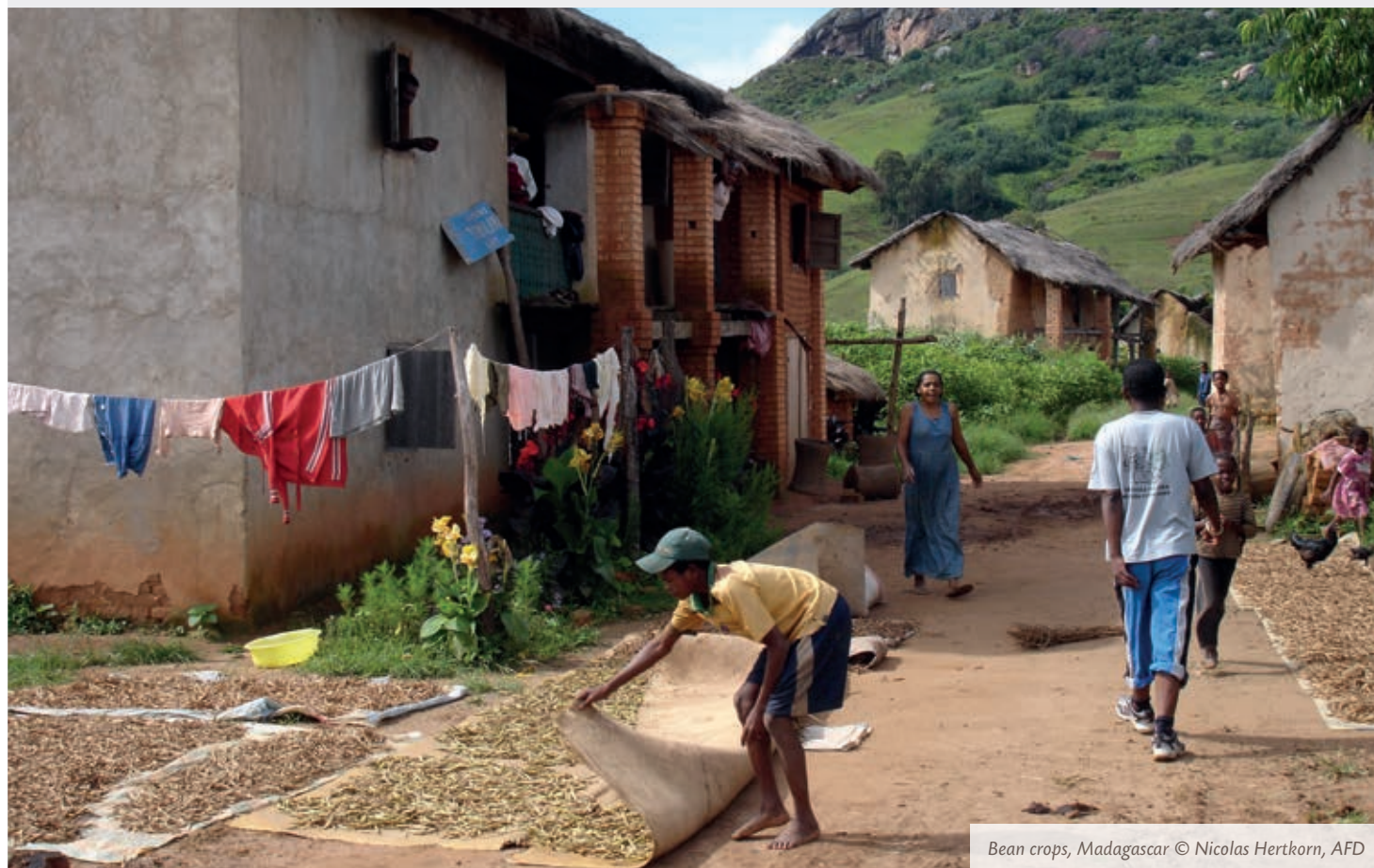
Bean crops, Madagascar

Agence Française de Développement (AFD), a public financial institution that implements the policy defined by the French Government, works to combat poverty and promote sustainable development. AFD operates on four continents via a network of 75 offices and finances and supports projects that improve living conditions for populations, boost economic growth and protect the planet. In 2015, AFD earmarked EUR 8.3bn to finance projects in developing countries and for overseas France.