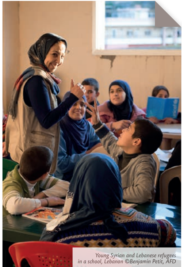
Young Syrian and Lebanese refugees in a school, Lebanon

Over the past 10 years, the PPI has financed 181 projects in Africa for a total amount of EUR 6.3m. The average amount allocated is a EUR 35,000 grant.