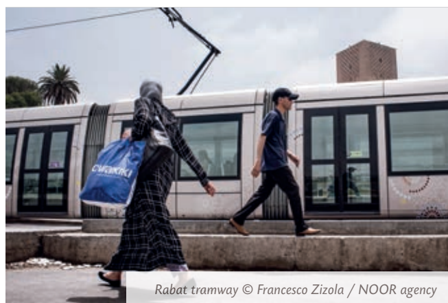
Rabat tramway

The acceleration of climate change obliges us to build new development trajectories, low in carbon and resistant to the effects of climate change. Since 2005, AFD has proved its ability to act in favor of both development and the fight against climate change: 55% of the projects it supported throughout the world in 2015 met this dual ambition.