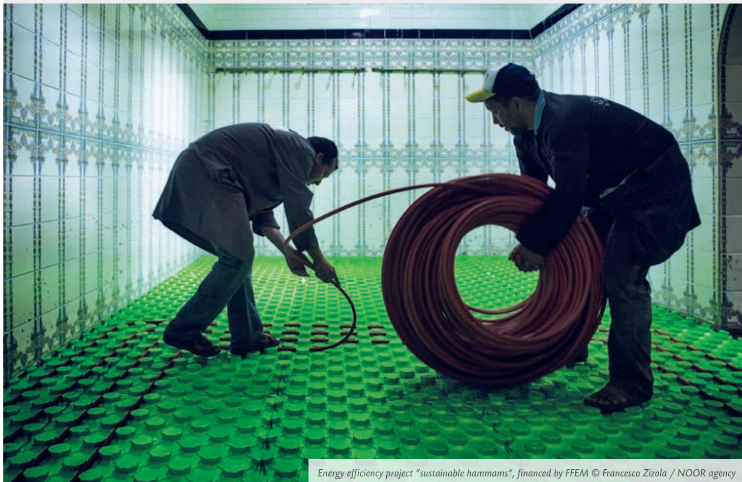
Energy efficiency project "sustainable hammams", financed by FFEM

Agence Française de Développement (AFD), a public financial institution that implements the policy defined by the French Government, works to combat poverty and promote sustainable development. AFD operates on four continents via a network of 75 offices and finances and supports projects that improve living conditions for populations, boost economic growth and protect the planet. In 2015, AFD earmarked EUR 8.3bn to finance projects in developing countries and for overseas France.