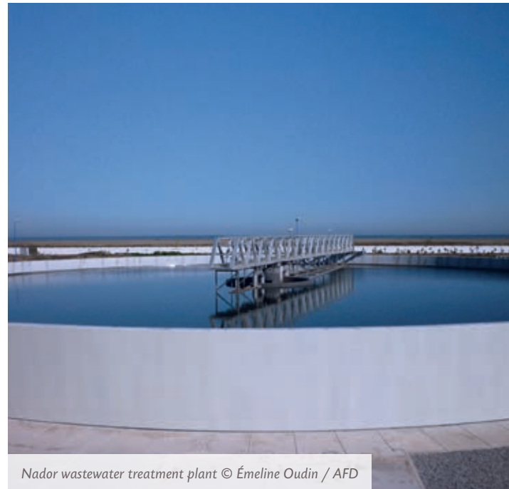
Nador wastewater treatment plant

Industry: contribution to sustainable development strategies of Moroccan companies, notably the Office Chérifien des Phosphates (OCP) Water Strategy (reuse of treated wastewater in industrial processes, desalination) which aims to put an end to all withdrawal of groundwater.