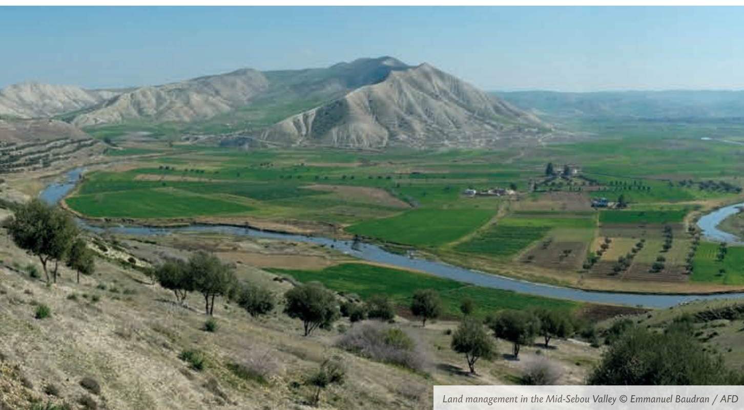
Land management in the Mid-Sebou Valley