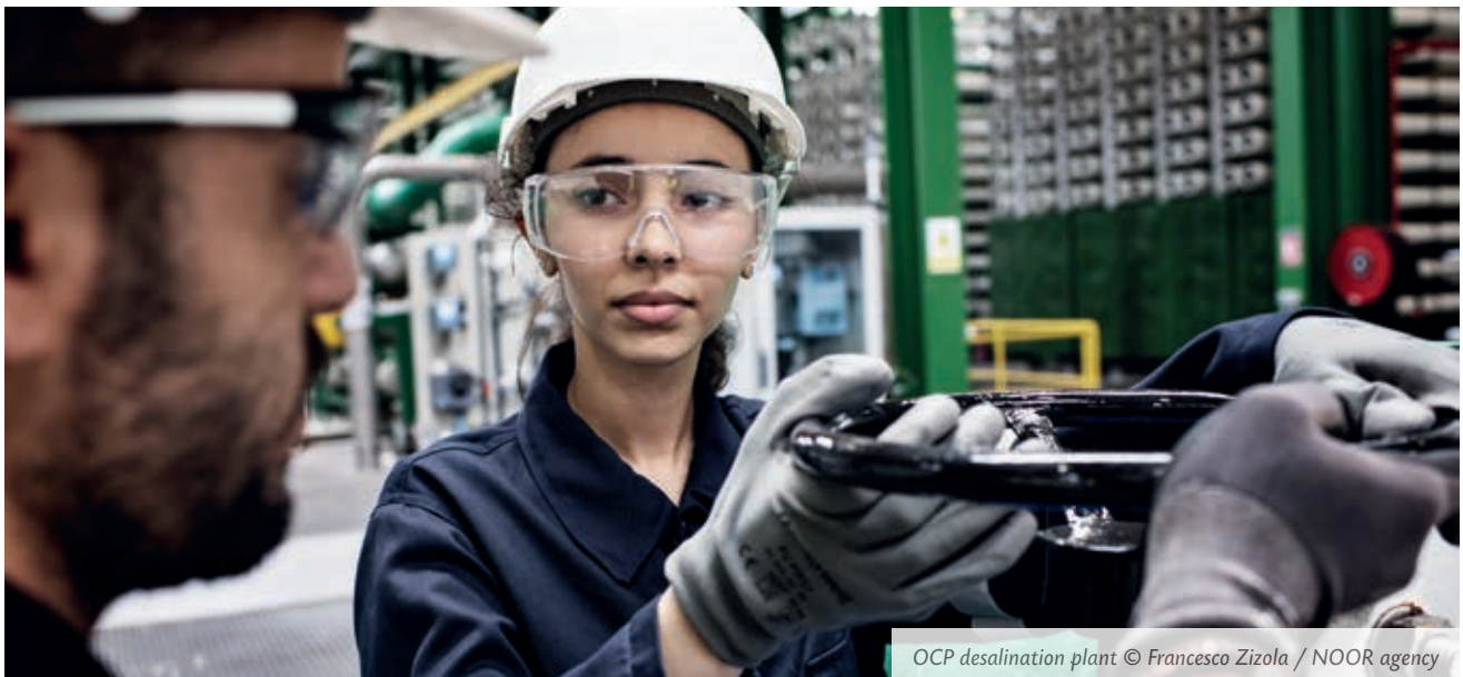
OCP desalination plant