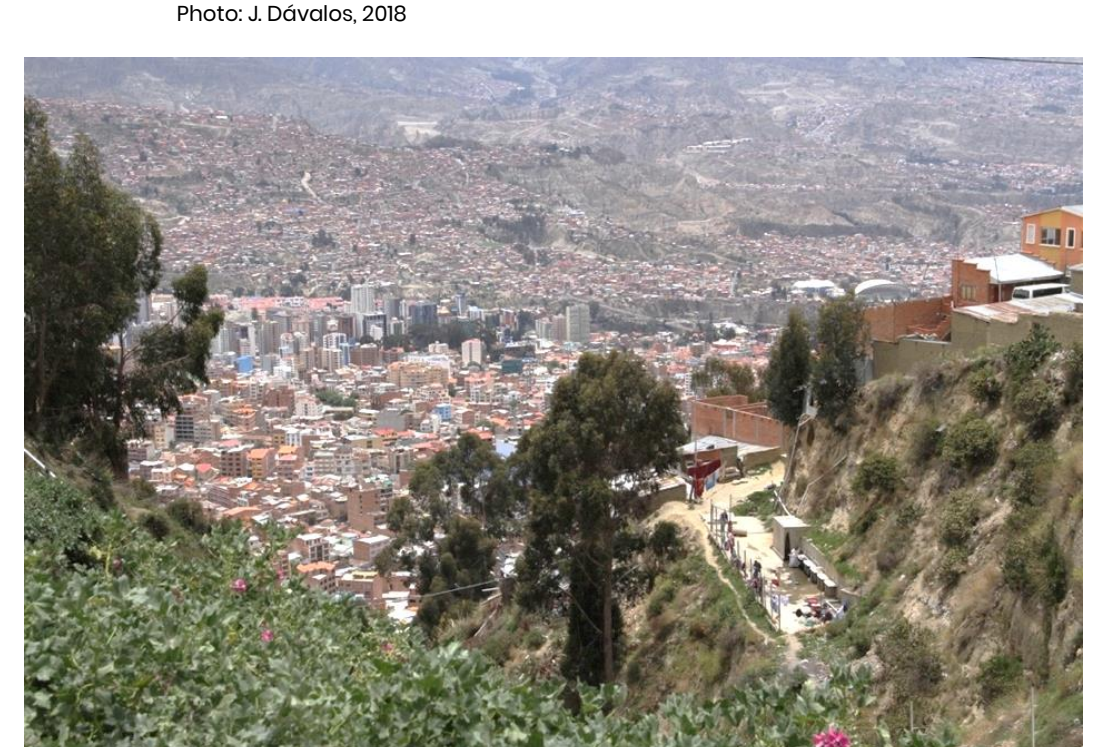
Picture 9. Collective springs and laundries: rural enclaves on the western slope of the city of La Paz

The social use of springs, for the consumption and washing of clothes, is marked by factors such as landslides and the water crisis. But, also by the presence of institutions that regulate the use of water (water cooperatives and the public water company). A harmonious landscape in this case study is also given by a good capture of underground water, the adequate construction of laundries, and social participation in the issues of spring management.