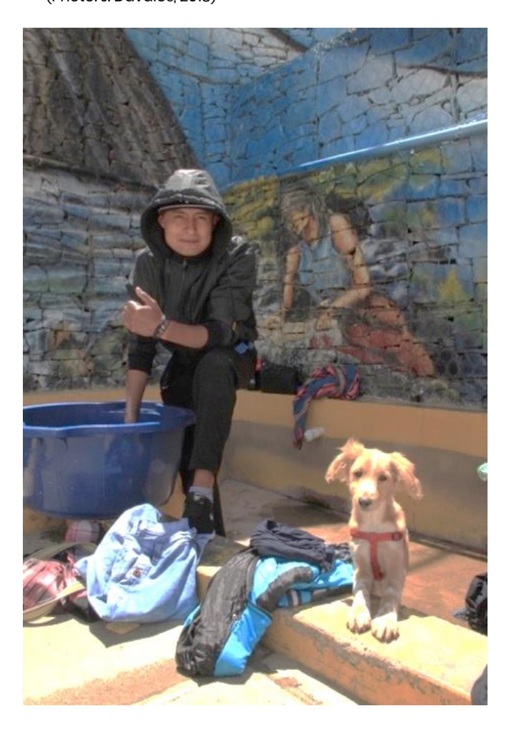
Picture 4: Laundries of Pasankeri, a young man and his pet