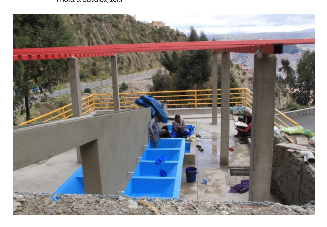
Picture 6. Kenanipata laundries and laundresses (In the center, Mrs. Primitiva Ticona and her grandson. Distribution of water in various pipes; central water container dissappeared)

The absence of toilets in these spaces is another aspect to reflect considering that women spend many hours with their children in these places. Of the four places observed, only one has toilets.