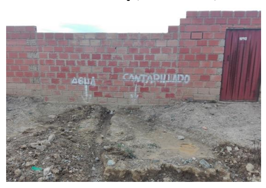
Picture 2: El Alto, Municipal district 7. Nueva Florida housing development. Installation of water and sewerage

The work dynamics of EPSAS are closely linked to the neighborhood councils that exert pressure on the institution and coordinate the details regarding the execution of works and solutions for everyday problems. These relationships are established with many neighborhood councils that have the competence to manage access to water. Therefore, greater interactive empathy with public water managers, effective pressure or other affinities may result in breaking the unwritten rule that states that an unpopulated housing development should not receive water; there have been cases of housing developments that were provided with drinking water with half of the dwellings actually being empty.