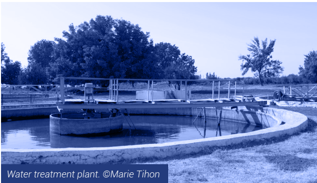
Water treatment plant.

In light of these realities, AFD Group and the European Commission are mobilizing to improve the delivery of water and sanitation services for communities, both in major urban centers, rural areas, and regions affected by crises. These interventions are designed taking into account climate risks, such as flooding, and can propose the development of innovative solutions, such as reusing wastewater for agriculture.