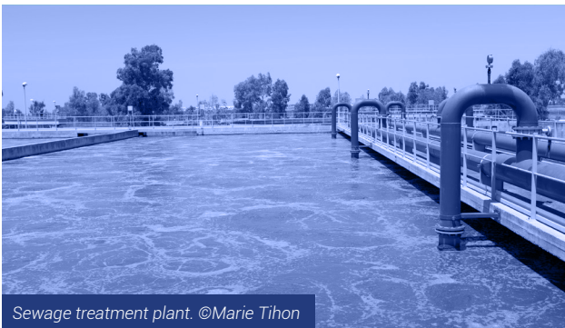
Sewage treatment plant.

Using an integrated approach, AFD Group seeks to prevent crises by addressing their structural causes, as well as their effects, with the aim of enhancing the resilience of countries and citizens in the short, medium and long term. Its interventions combine emergency work with social and economic development projects. In these high-pressure situations, more than anywhere else, it prioritizes a partnership approach, especially with its European partners.