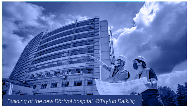
Building of the new Dörtyol hospital.

million m 3 /year of untreated wastewater discharge into the environment avoided