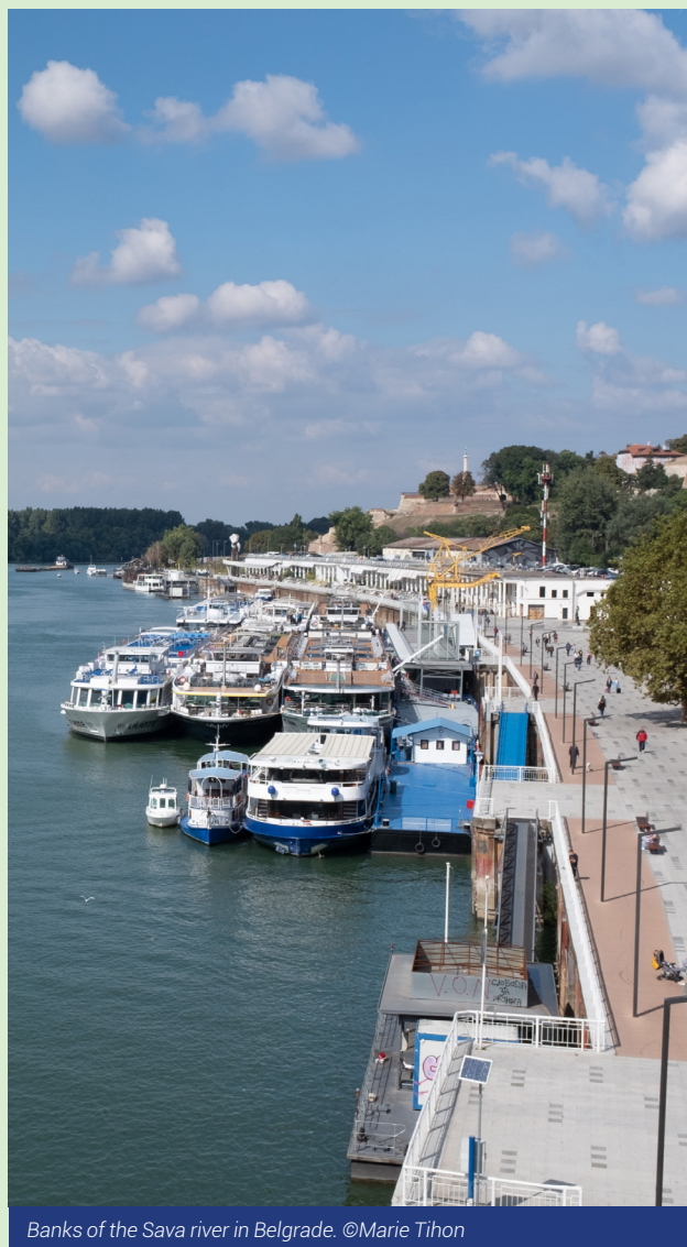
Banks of the Sava river in Belgrade.