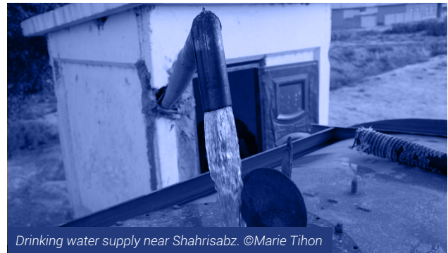
Drinking water supply near Shahrissabz.