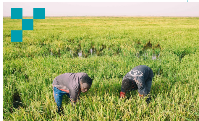
In Senegal, the 3PRD programme to promote investment in rice production developed a total of 2,110 hectares, which gave new farmers, 22% of whom are women, access to land.