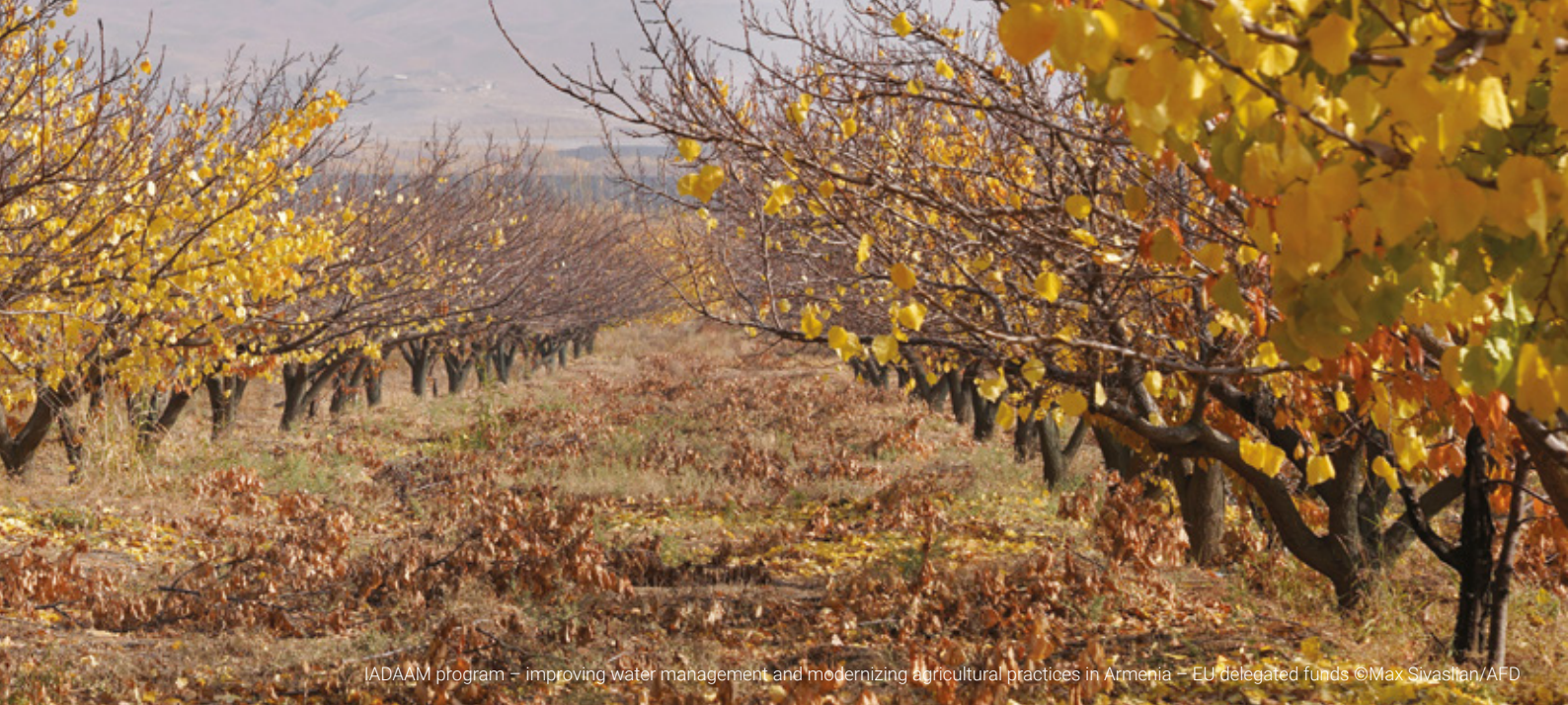
ADAAM program – improving water management and modernizing agricultural practices in Armenia – EU delegated funds