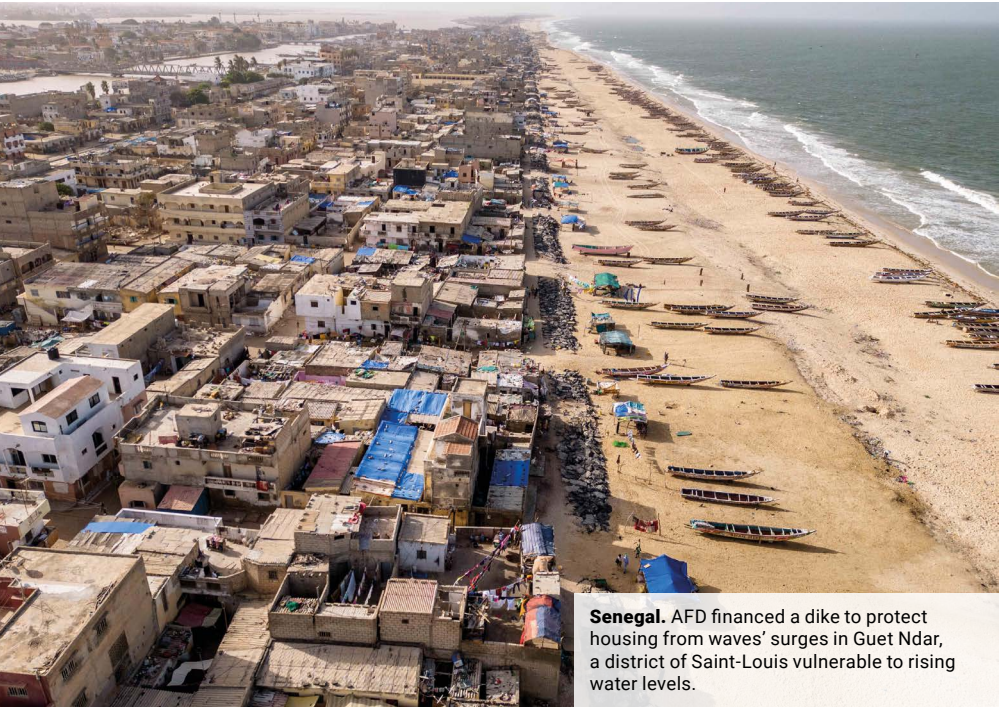
Senegal. AFD financed a dike to protect housing from waves' surges in Guet Ndar, a district of Saint-Louis vulnerable to rising water levels.