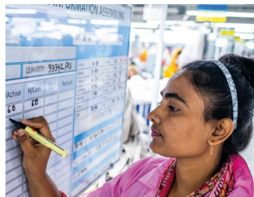
Bangladesh. HERhealth, supported by Proparco, improves the everyday lives of employees in the textile sector.

The ambition of contributing to the promotion of gender equality is also a key pillar of Proparco's 2023-2027 strategy, with a target of €1.9 billion in commitments for projects aligned with the 2X Challenge (1) over three years (2023-2025).