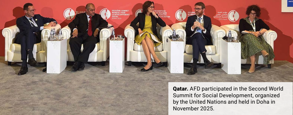
Qatar. AFD participated in the Second World Summit for Social Development, organized by the United Nations and held in Doha in November 2025.

Quantitative and qualitative data on impacts and results related to social cohesion will be published.