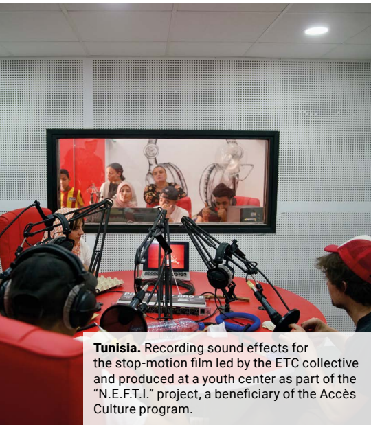
Tunisia. Recording sound effects for the stop-motion film led by the ETC collective and produced at a youth center as part of the “N.E.F.T.I.” project, a beneficiary of the Accès Culture program.