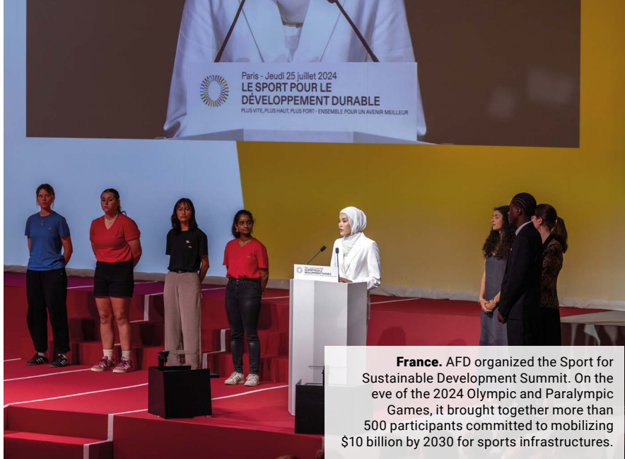
France. AFD organized the Sport for Sustainable Development Summit. On the eve of the 2024 Olympic and Paralympic Games, it brought together more than 500 participants committed to mobilizing $10 billion by 2030 for sports infrastructures.