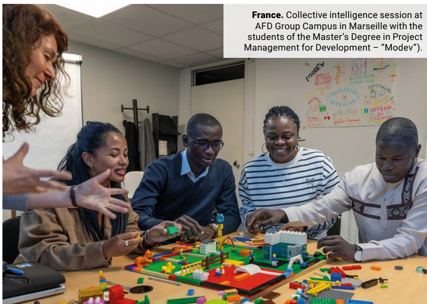
France. Collective intelligence session at AFD Group Campus in Marseille with the students of the Master's Degree in Project Management for Development – "Modev").

At AFD Group, we will continue to implement our feminist commitment in our internal practices.